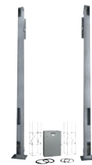
Vertical Lift Operator

HySecurity operators secure the world's critical infrastructure and key assets where ultimate reliability is vital. HydraLift delivers uncompromising quality to industrial customers worldwide, where ease of use, consistent operation, low maintenance, long life and high reliability is expected.