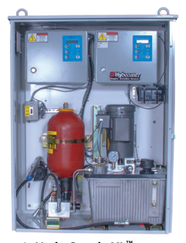
HydraSupply XL <sup>™</sup> (Pictured: Two controllers for twin model)