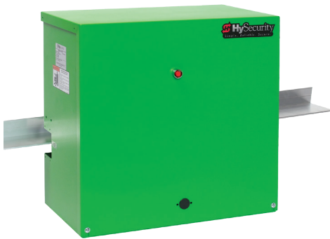
SlideDriver - AC models