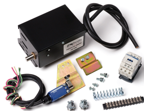
Internal Solenoid Lock Kit