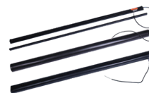
ASO Edge Sensors

SlideSmart CNX and SwingSmart CNX require professional installation