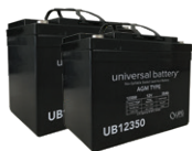
Battery Backup Kit - 35Ah