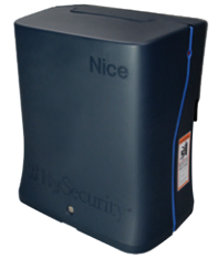
Slide Gate Operator