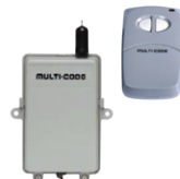
Radio Receivers & Transmitters